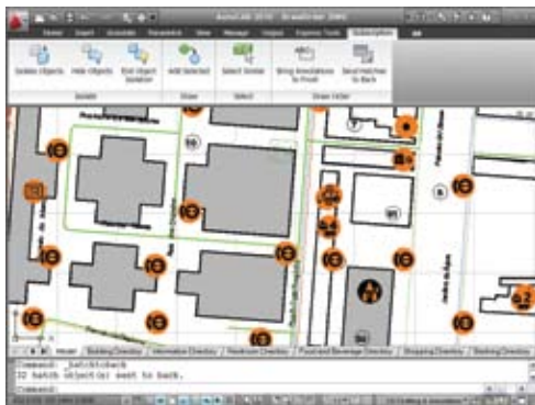
Isolate objects and hide objects tools display only relevant geometry.