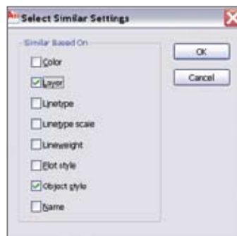
Select similar settings dialog box to specify on which properties to filter when using the Select Similar tool.

Subscription Advantage Packs can be downloaded by signing in to Subscription Center. For more information visit www.autodesk.com/advantagepacks .