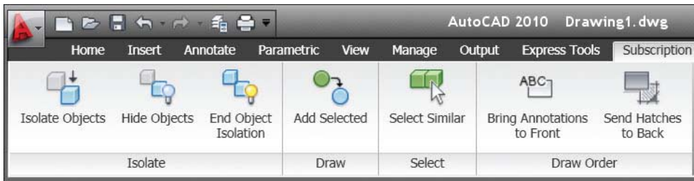
Subscription ribbon tab provides easy access to all the new tools.